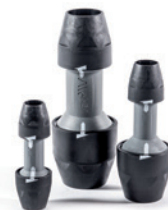
White torque indicators (PF Series)